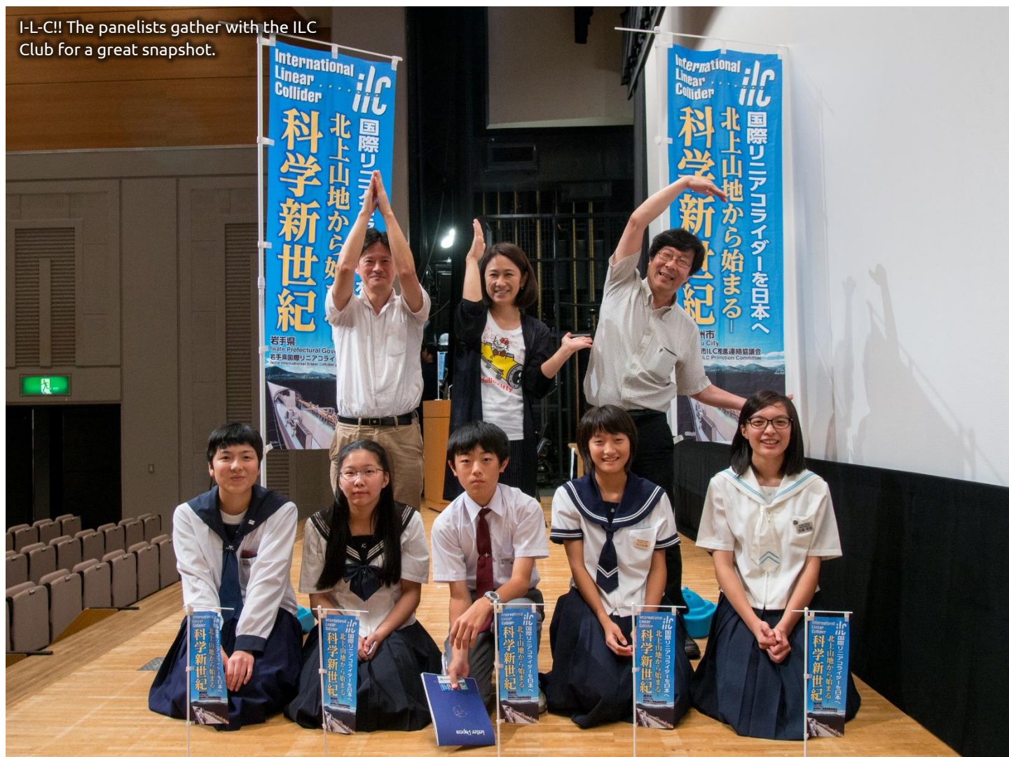
I-L-C!! The panelists gather with the ILC Club for a great snapshot.