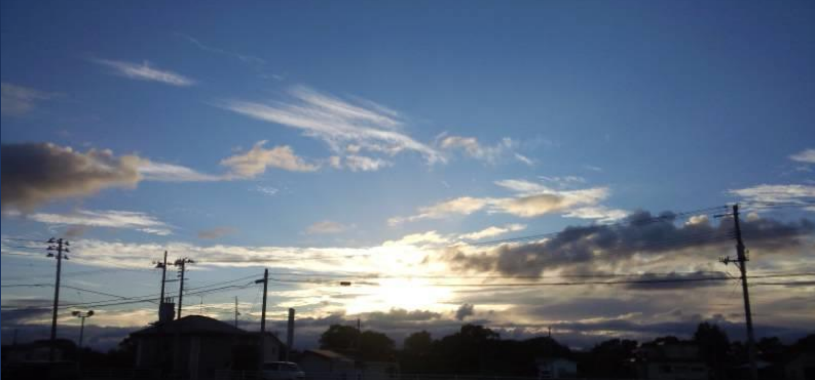
A beautiful sunset in Oshu

Don't let the rice paddies fool you: it's got huge box stores too. Conversely, don't let the bullet train station and chain stores fool you, it has some great history and scenic beauty to it. I suppose it all is how you look at it. However, keep yourselves open to the possibility of having the best of both worlds, as I am learning day by day. I look forward to exploring, seeing, and enjoying much more of Oshu.