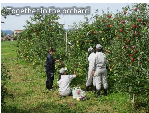
Together in the orchard