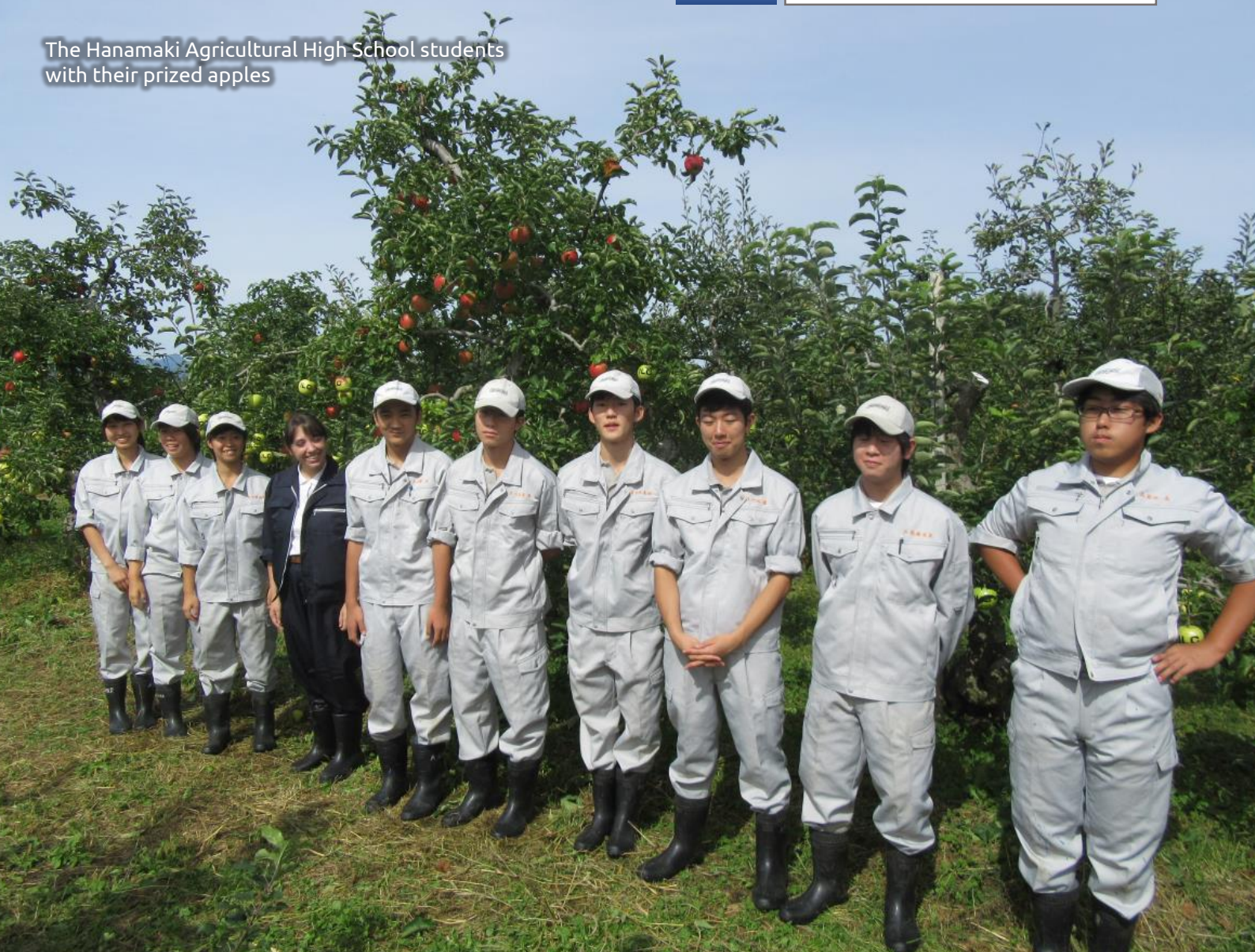
The Hanamaki Agricultural High School students with their prized apples